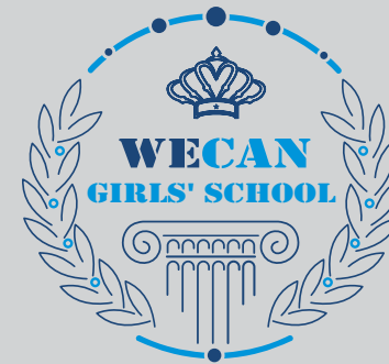
The Girls' School Jaipur | India

K N O W L E D G E & W I S D O M F O R B L I S S