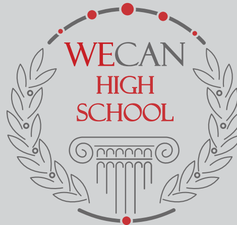
Senior Secondary School Jaipur | India